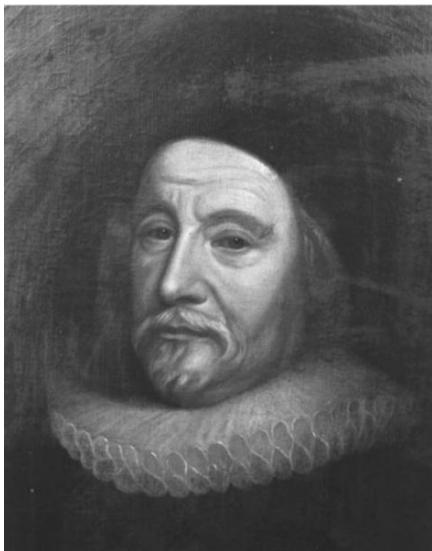
James Ussher (1581– 1656) Anglican Archbishop of Armagh and Primate of All Ireland.

samples are fresh and unaltered. It works for samples from 4.6 billion years to around 100 000 years ago; this is based on the detection limits of the equipment used.